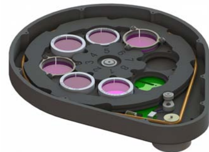
CFW31-8R showing threaded 1.25" filters from Astrodon, Baader, Orion, and Astronomics, as well as single and dual 31mm drop-in filters from Astronomics