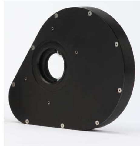
CFW25-6R filter wheel