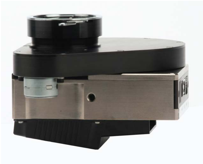
CFW25-6R with Nikon F-mount lens adapter mounted on Ascent camera