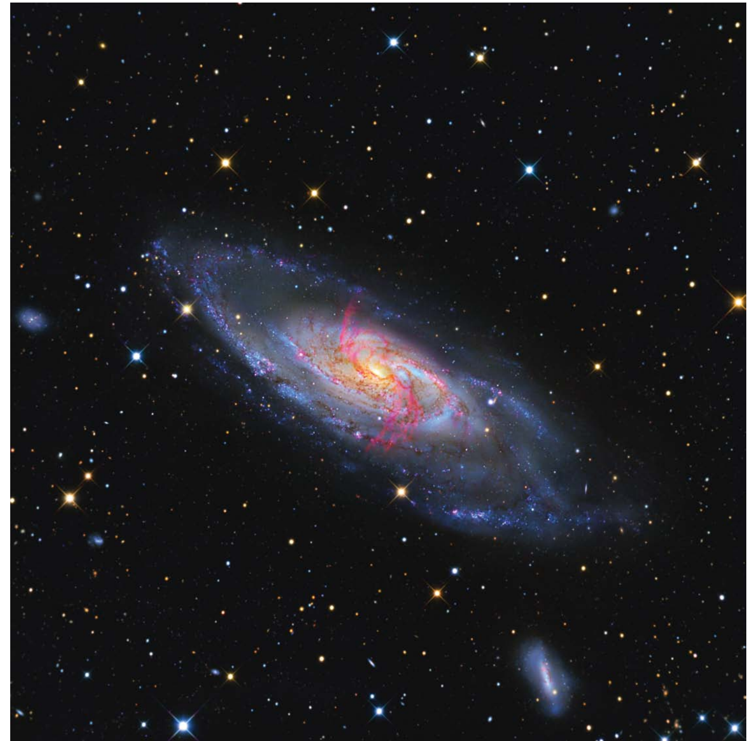
NGC 4258. Apogee Instruments Alta U16M (4096 x 4096) camera. RC Optical 20" Truss Telescope. AstroDon LRGB and H-alpha Filters Blackbird Observatory, New Mexico

©2011 Apogee Imaging Systems Inc. Alta is a registered trademark of Apogee Imaging Systems Inc.